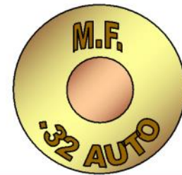
.32 Auto cartridge made at MF during the years 1934

Be that as it may, the factory did produce this type of cartridge and it is a bit of an oddity for several reasons. Firstly it was a civilian calibre produced when the factory was making mostly military ammunition. I believe it is not stretching things too far to make the assumption that it was an effort to keep the factory running in those lean depression years. It is noteworthy that the Factory has not produced the item since 1941. Secondly, the projectile has a Monogrammed core. Now this is not unusual as the Germans and the British have been doing this sort of thing for years but I believe it is one of the few Australian projectiles so marked.