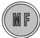
The embossed projectile base.

Apart from these points it is a standard .32 auto with all the inherent failings of such a small calibre pistol cartridge. In fact the author has talked with senior police officers in the NSW force who have been sent out armed with these minuscule firearms to look for a lion that had escaped from a circus in the early fifties. I am assured that it was only after several hours looking for this lion that the policemen suddenly realized the enormity of what they were actually doing and decided very sensibly that they should go home. Mind you it is not too long back here in Queensland that a drug dealer was accidentally shot with one of these cartridges and it killed him outright. Just remember it's not the calibre that kills you it's the shot placement.