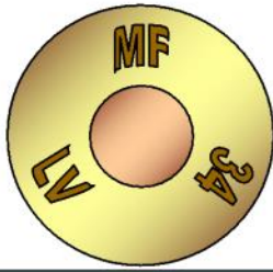
Mk V made at MF in 1934. This model was made from 1910 to 1942