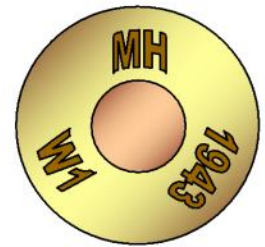
Mk V blank filled at Hendon SA using a reject AP case. Blanks were made here from 1942 to 1945.