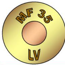
Mk V blank showing variation in position.