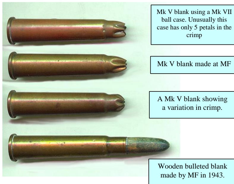
Mk V blank using a Mk VII ball case. Unusually this case has only 5 petals in the crimp

In addition to the above headstamps there will be found many blanks with headstamps showing Incendiary, ball and grenade launcher origins. Any reject case was utilized as a blank cartridge during the war years. Many blanks will be found with no headstamps at all, such as the rush for wartime production.