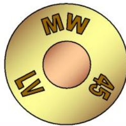
Mk V blank made at MW in Western Australia from 1943 to 1945.