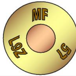
Mk.9z blank filled at MF. This model was made from 1957 to 1962.