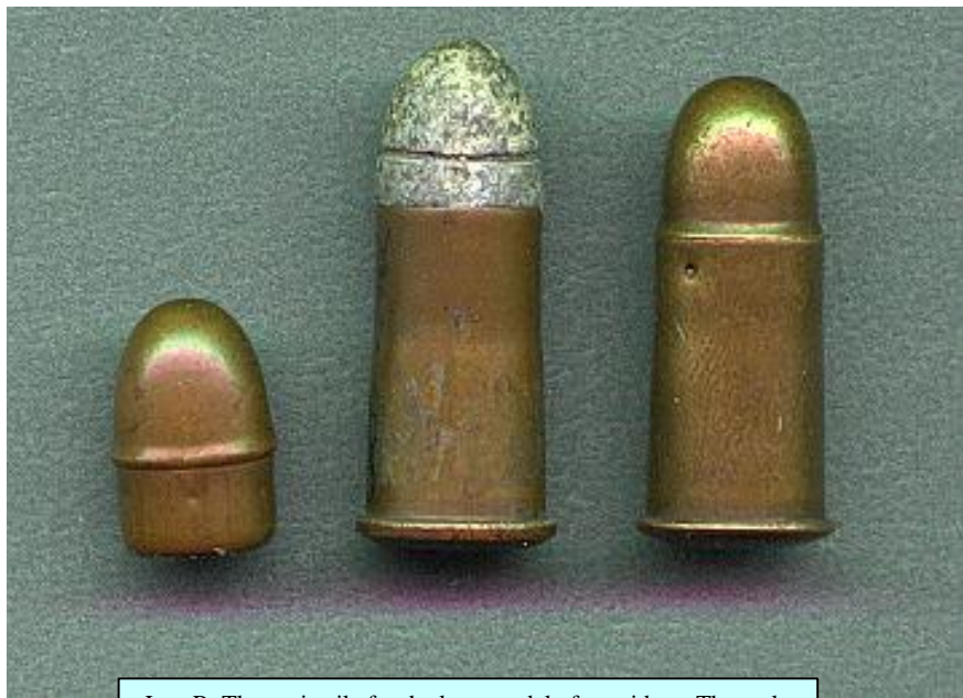
L to R. The projectile for the later model of cartridges. The early ball cartridge and then the domed based ball cartridge.