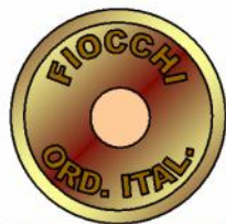
Early production with chamfered base and lead projectile.