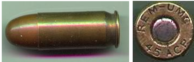
.45 Thompson M1923

The pistol origin of the .45 ACP cartridge limits the range of the projectile. In recognition of this simple fact the Auto Ordnance Corporation introduced the Military Model 1923 which was chambered for the longer cased .45 Thompson cartridge. Remington Arms Company produced this cartridge which has a greater powder capacity and a 250 gn projectile. It was claimed that greater range and penetration were available with this cartridge but the public was not convinced and the cartridge faded from the scene very quickly.