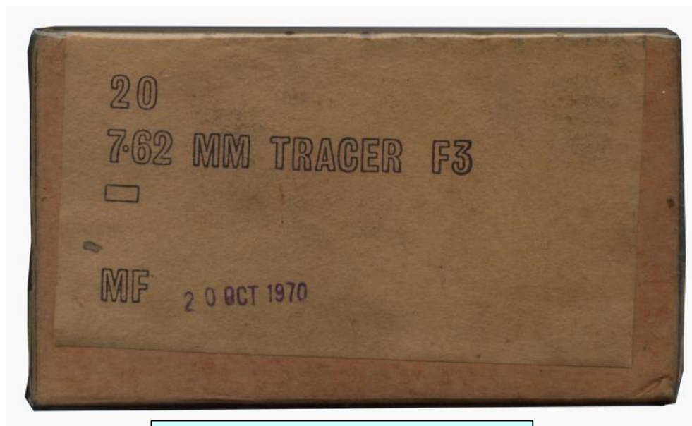
Standard packet for 7.62mm Tracer cartridges.