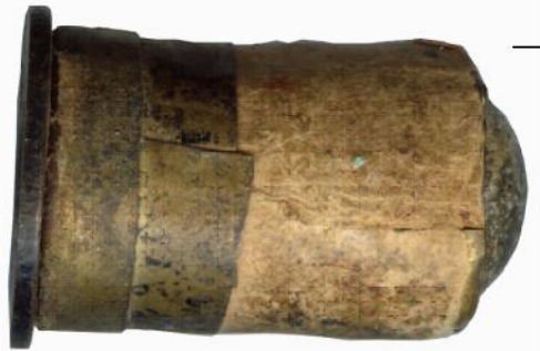
.577 Boxer pistol wrapped brass boxer version.