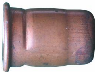
Blank cartridge with Benet primer