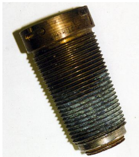
Percussion DA No 44, this fuze has its cap missing.